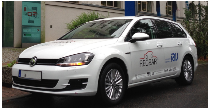
Fig. 1. Prototype car equipped with real-time Ethernet backbone and high-bandwidth sensors

In the presented prototype car (see figure 1), we install a real-time Ethernet based backbone network. Gateways between the legacy fieldbusses (CAN) and the Ethernet network transparently translate messages, allowing communication to cross the borders of both technologies. By adding high bandwidth sensors, in particular HD cameras and 3D laser scanners we fully utilise the bandwidth limits of the automotive certified OPEN Alliance 100Mbit/s BroadR-Reach (OABR) [1] physical layer. By running challenging applications, such as sensor fusion, we add rigid temporal demands. During the test, a dedicated control unit in the network logs every aspect of the communication. This allows us to offline analyse the backbones behaviour and feed simulation models to gain a deeper understanding of effects that are usually hidden.